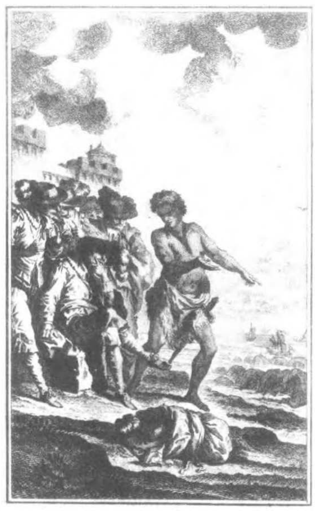
Il retourne ches les Eganx

He returns to his equals, see note p 120